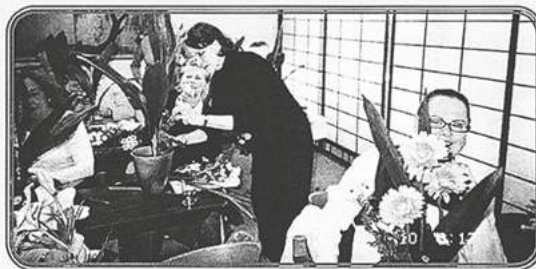
SFGC students work to perfect their Ikebana creations.