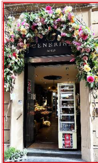
Door frame flowers in Italy.