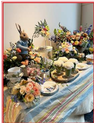
Table Settings Boutique Vendors Live Auction Silent Auction Floral Demonstration Lunch