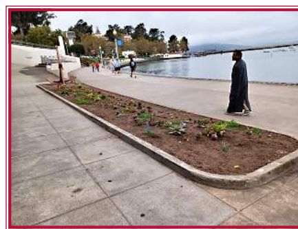
Planter at Maritime Museum

Civic Participation applications are available to qualifying organizations beginning January 2025. We know our members are well-connected and can help spread the word about this grant opportunity. The awards given can be up to $5,000 or more depending on our 2025 funding capacity. If interested, you can ask to have part or all your donation benefit Civic Participation activities.