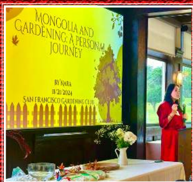
Topic: Mongolian Gardening