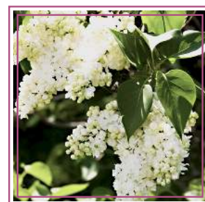
Madame Lemoine Lilac