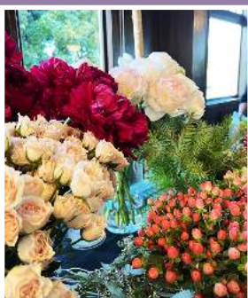
Flowers for arrangements